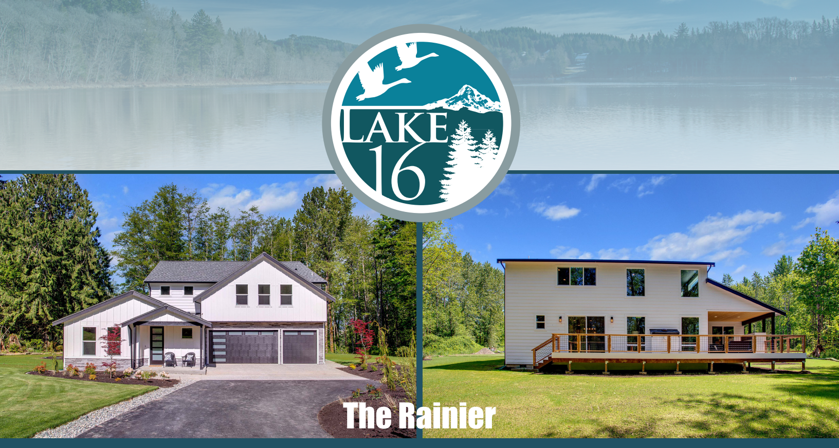
3,091 sq. ft. - 4 Beds, 3.5 Baths, Great Room, Bonus Room/2nd Master Suite, and Den/Home Office - MLS #1773141